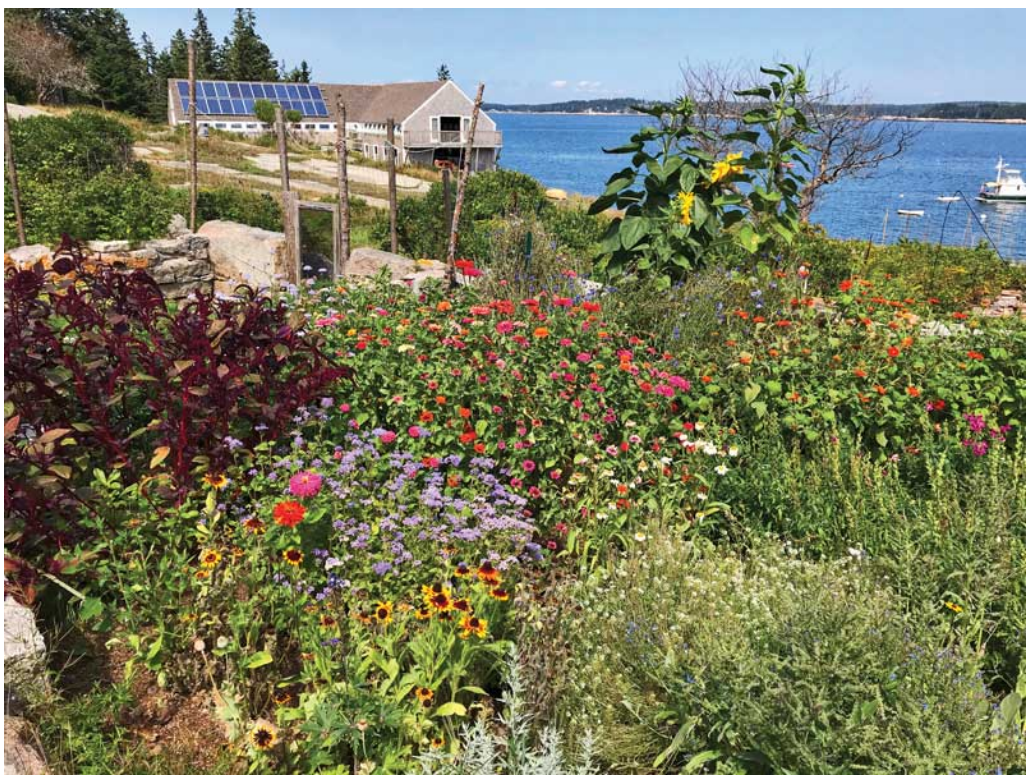
Hurricane Island was home to a granite quarry company and then an Outward Bound School before the Hurricane Island Foundation began running science-based programs there in 2009.