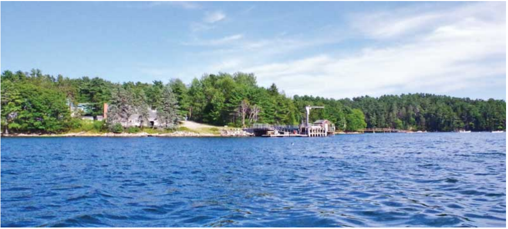
The Darling Marine Center waterfront as seen from the Damariscotta River.

The Damariscotta River shimmers a brilliant blue-green. Only the screeching of terns and gentle washing of waves interrupts the quiet. Some boats are parked in the meadow on the hill, others are moored offshore or at the dock. SCUBA gear dries on wooden racks.