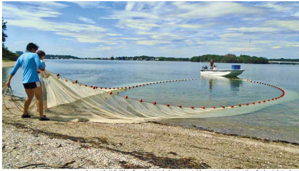
Interns at the Gulf of Maine Research Institute haul in nets as part of the organization's long-term Casco Bay Aquatic System Survey.

For many scientists in the early 1900s, Woods Hole on Cape Cod had been the center of marine research, but it was getting harder to get specimens and supplies there. Sand dollar embryos, horseshoe crabs, spiny sea urchins, starfish, and skates were scarce.