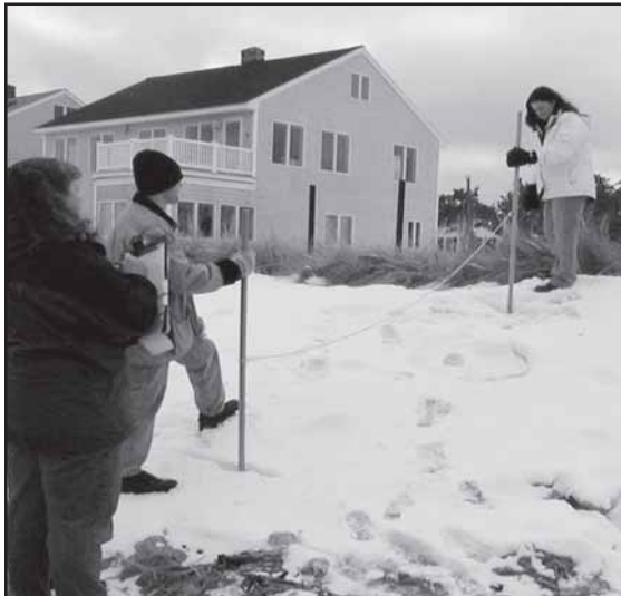
Kinney Shores Beach in Saco.