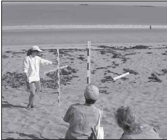
Mile Beach, Reid State Park